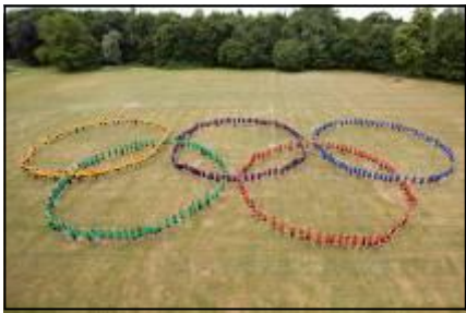
Olympic rings formed by 400 schoolchildren in their house colours. Buckinghamshire. July 2010