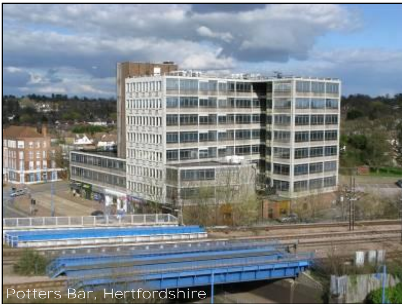
Potters Bar, Hertfordshire