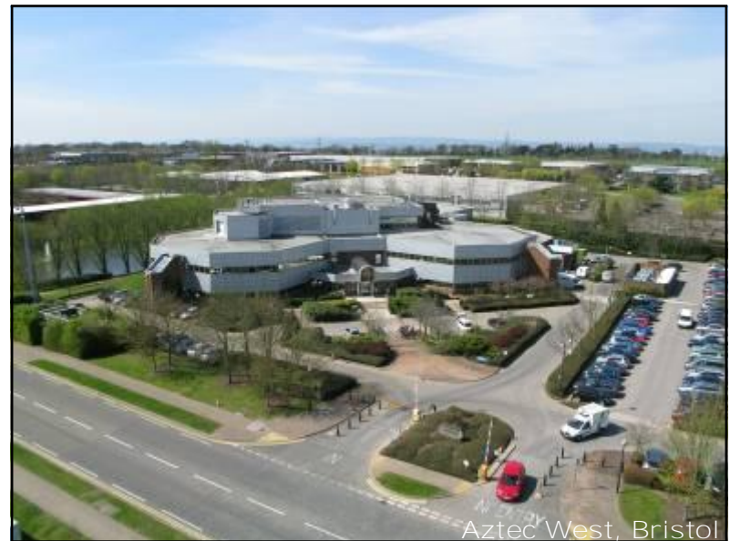
Aztec West, Bristol