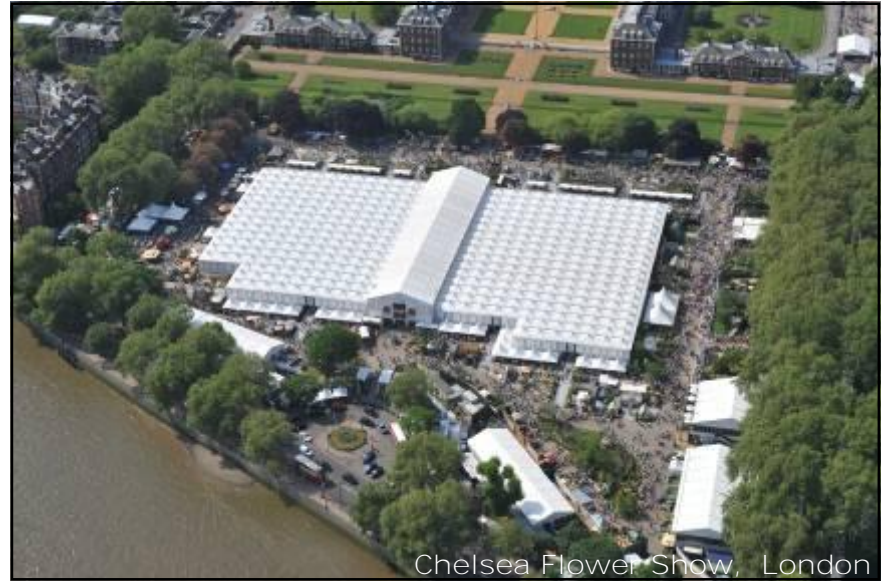
Chelsea Flower Show, London