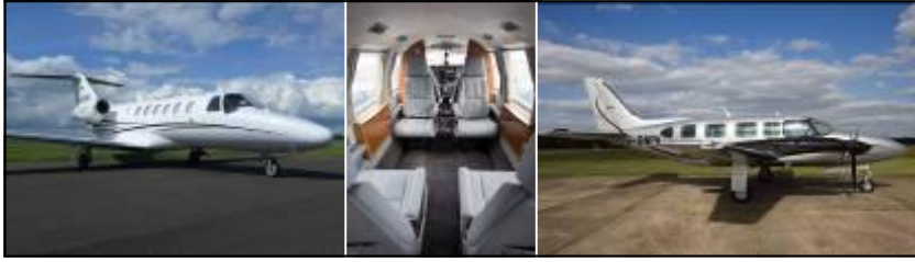
High Level supply Synergy Aviation with images of their aircraft fleet for their website