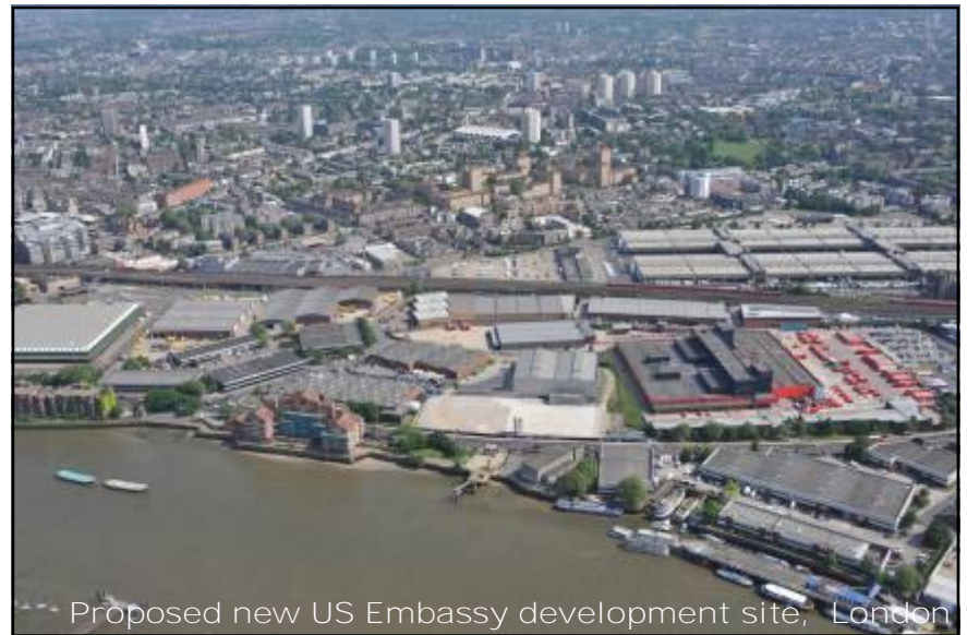
Proposed new US Embassy development site, London