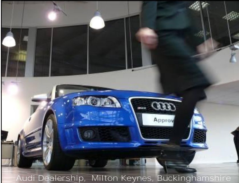
Audi Dealership, Milton Keynes, Buckinghamshire