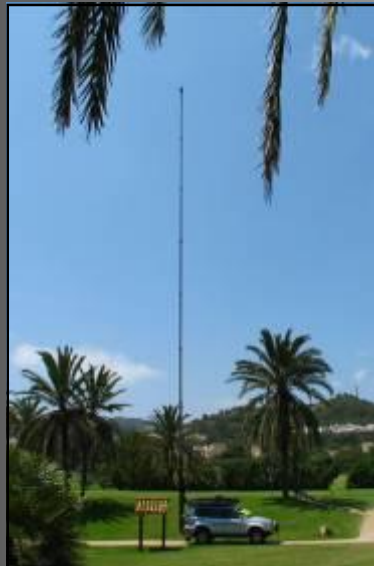
Mast fully extended on High Level's vehicle La Manga, Spain.