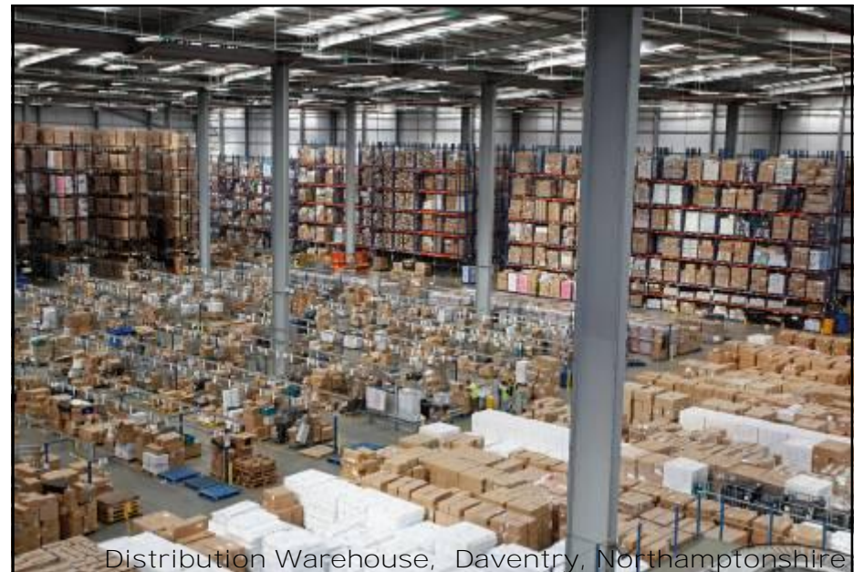
Distribution Warehouse, Daventry, Northamptonshire