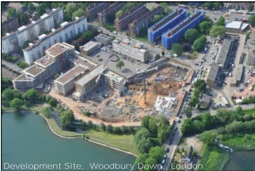
Development Site, Woodbury Down, London