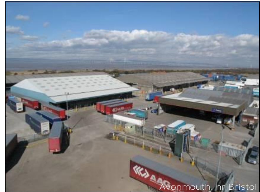
Avonmouth, nr Bristol