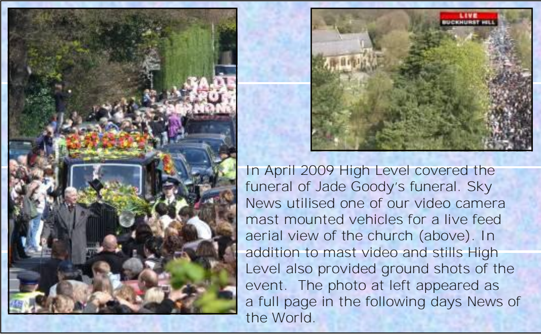
In April 2009 High Level covered the funeral of Jade Goody's funeral. Sky News utilised one of our video camera mast mounted vehicles for a live feed aerial view of the church (above). In addition to mast video and stills High Level also provided ground shots of the event. The photo at left appeared as a full page in the following days News of the World.