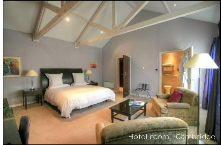
Hotel room, Cambridge