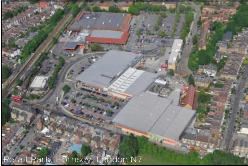
Retail Park, Hornsey, London N7