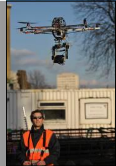
Camera mounted UAV deployed to take images of development site to height of 27th floor.