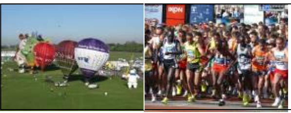
April 2009 High Level covered the start of the London Marathon at Blackheath both from the mast and ground shots. Various images were subsequently published in the UK press.