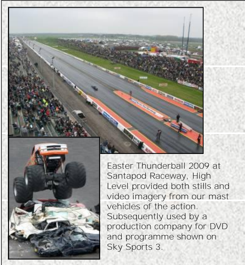
Easter Thunderball 2009 at Santapod Raceway, High Level provided both stills and video imagery from our mast vehicles of the action. Subsequently used by a production company for DVD and programme shown on Sky Sports 3.